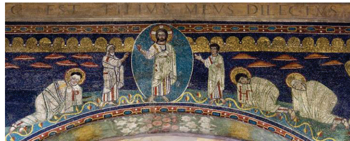
Transfiguration – Mosaic in the Apse of the Basilica Church of Saints Nereus and Achilleus in Rome. (Mosaic from early IX c).